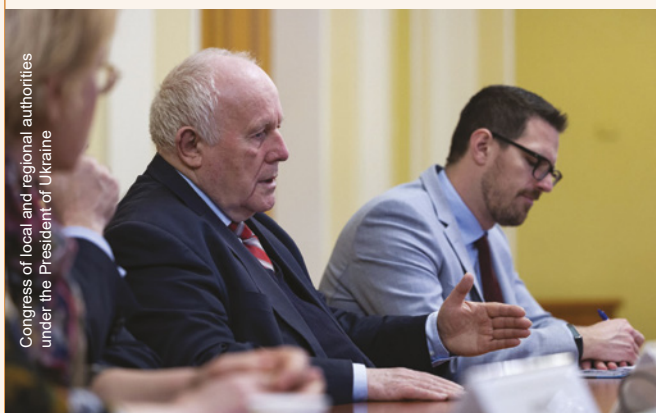
Congress of local and regional authorities under the President of Ukraine

U-LEAD cooperates with the Verkhovna Rada Committee of Ukraine on State Power, Local Self-Government, Regional Development and Urban Planning as well as with the Ministry for Communities and Territories Development of Ukraine, contributing to the alignment of Ukrainian legislation in the field of local self-government and regional development with the EU acquis.